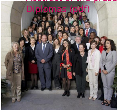
All GEMMA Coordinators were present and current

GEMMA students (3rd and 4th edition) were also invited to participate, presided by the Spanish Minister of Equality, Ms. Bibiana Aído, was followed by the Intercultural Forum for Young Researchers “Voices of GEMMA: Exchanging Experiences of Research in Women’s and Gender Studies in a Transnational Context” In this part of the event GEMMA graduates shared their experiences and the results of their research projects completed within the programme. The experience proved an excellent means for the dissemination of their learning outcomes and for the open monitoring of their future research. The ceremony had the widest repercussion in all regional, national and international press (more even so since this was the last public act conducted by Bibiana Aído as Minister of Equality). The event marked also the first steps for the creation of a GEMMA alumni association which will give the programme and the consortium feedback on to what extent the expected goals of the programme have been achieved, whether their graduates have found insertion in the expected professional fields and the degree of satisfaction with the formation acquired.