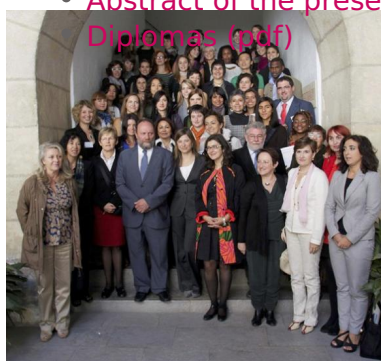
All GEMMA Coordinators were present and current

GEMMA students (3rd and 4th edition) were also invited to participate, presided by the Spanish Minister of Equality, Ms. Bibiana Aído, was followed by the Intercultural Forum for Young Researchers “Voices of GEMMA: Exchanging Experiences of Research in Women’s and Gender Studies in a Transnational Context” In this part of the event GEMMA graduates shared their experiences and the results of their research projects completed within the programme. The experience proved an excellent means for the dissemination of their learning outcomes and for the open monitoring of their future research. The ceremony had the widest repercussion in all regional, national and international press (more even so since this was the last public act conducted by Bibiana Aído as Minister of Equality). The event marked also the first steps for the creation of a GEMMA alumni association which will give the programme and the consortium feedback on to what extent the expected goals of the programme have been achieved, whether their graduates have found insertion in the expected professional fields and the degree of satisfaction with the formation acquired.